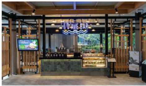
Wave Bar Restaurant