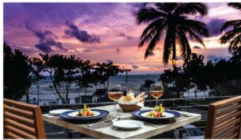
Inn Asia Restaurant

Experience exceptional cuisine of International and Thai, a sense of style at our signature with local specialties of unmissable menu items.