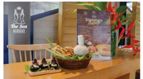
The Sea Massage